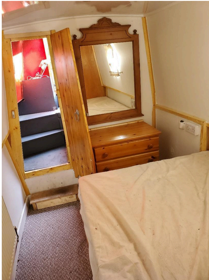
The bedroom looking to the engine room