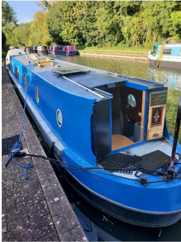
The rear deck showing steps down through the engine room to the bedroom

The main entrance is at the front of the boat leading into a living area followed by a kitchen with a passageway leading to the rear of the boat with a bathroom off to the side with shower and toilet and then on to the bedroom with a double bed and finally into the back cabin with stairs leading up to the back deck.