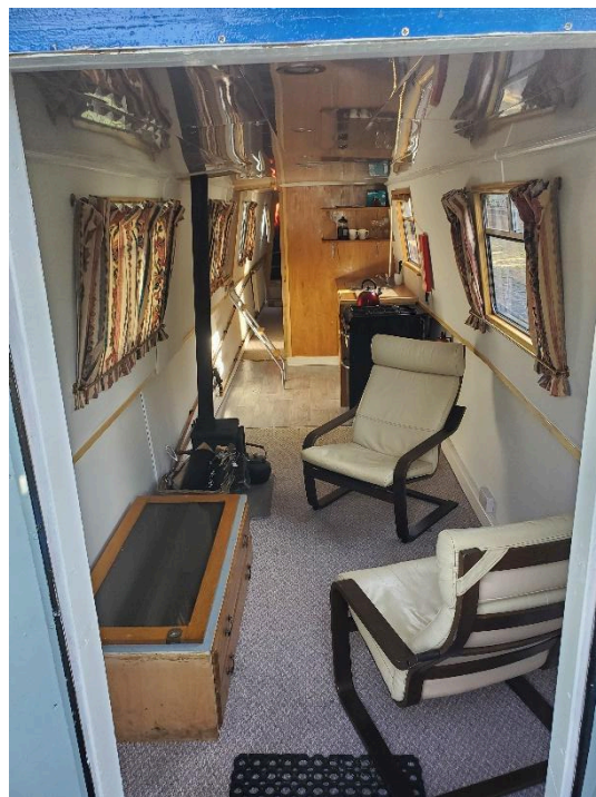
The living area with kitchen behind taken from the front door.