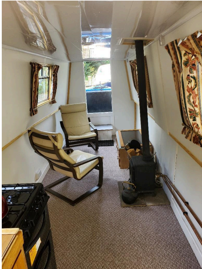
The living area looking from the kitchen toward the front door.